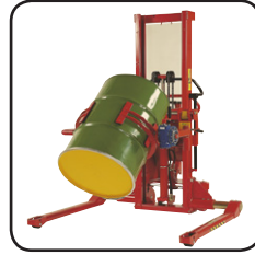
Available with side-tilting forks and/or optional extras, e.g. drum turner, remote control, level control, crane arm.