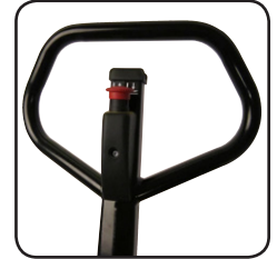
Ergonomic handle ensures the user a relaxed hold. The handle can be marked with the name/department.

Available with manual and electric lifting.