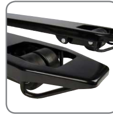
The hoop skates on the forks ensure an easy fork insertion and withdrawal in/out of pallets.