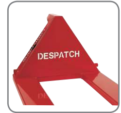
Name, logo or another text can be cut out in the A-frame or a special colour can be chosen.