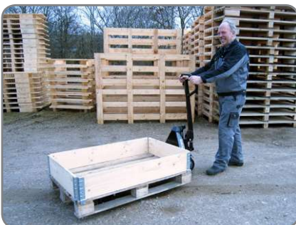
Panther Silent also manages outdoor transport. Metallic chips, small stones and snow do not get stuck to the wheels.