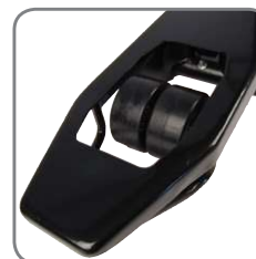
With twin fork wheels it is very easy to change direction.