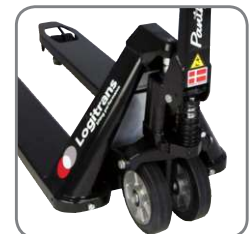
Panther Silent has permanent quick lift.