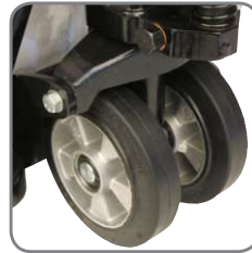
The special rubber wheels are gentle to floor and flagstone layer.